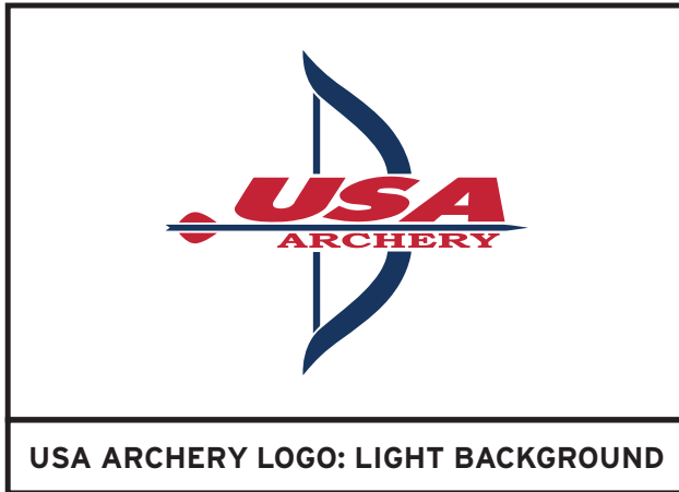
USA ARCHERY LOGO: LIGHT BACKGROUND

The winning design will have the USA Archery logo placed in a corner of the design, if not already present