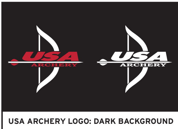
USA ARCHERY LOGO: DARK BACKGROUND