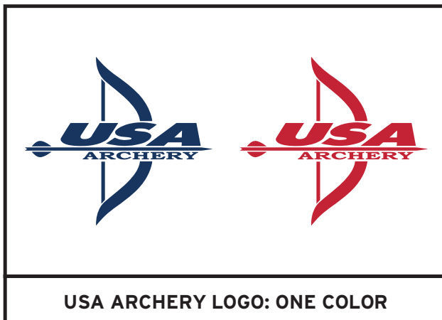
USA ARCHERY LOGO: ONE COLOR