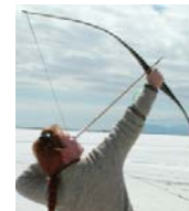
Modern American Longbow