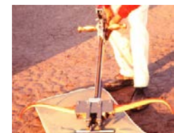
Unlimited Foot Bow